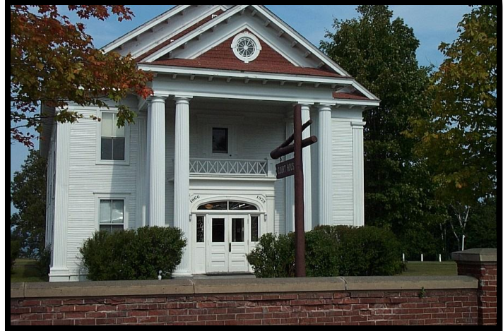
Keweenaw County Courthouse Eagle River

Today, the Town of Eagle River serves as the Keweenaw County seat, home to the County's administrative offices, court, and Office of the Sheriff. Five civil townships (Allouez, Eagle Harbor, Grant, Houghton, and Sherman) and the Village of Ahmeek make up the County. See Map 1. The Townships vary greatly in population, with Allouez the largest, having a population of 1,571 including the Village of Ahmeek, and Sherman the smallest with only 67 persons. Each maintains a Township Board, but due to limited resources, planning and zoning activities are carried out by the Keweenaw County Planning and Zoning Commission in all but Eagle Harbor Township. The Village of Ahmeek has its own council and relies on the County for zoning enforcement.