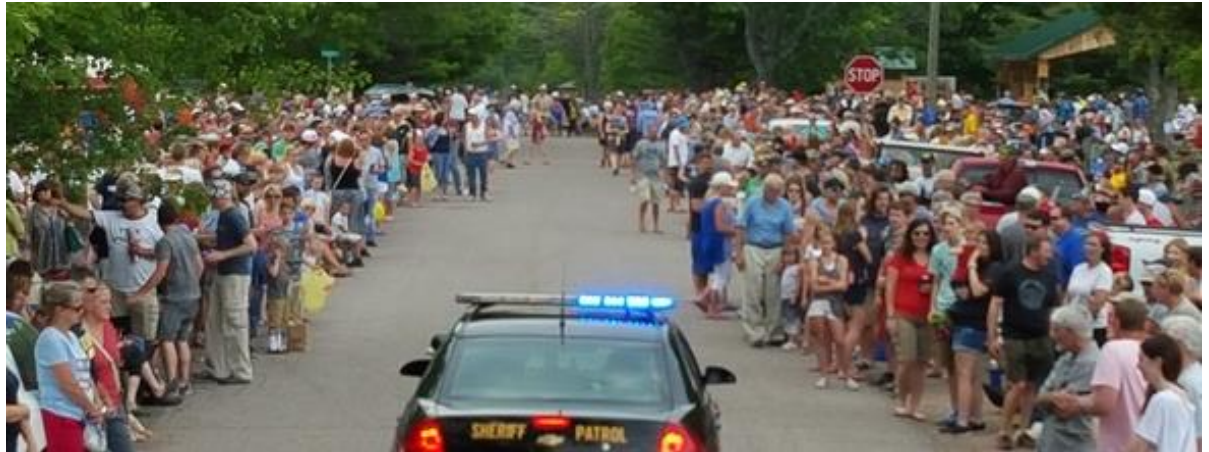
July 4 th Parade in Gay

Issue – Decreasing Ad-Valorum Tax Base: With the increasing number of tax exempt organizations preserving the Keweenaw, the ad-valorum rolls continue to diminish. The need for public safety does not decline with private ownership. The Township must maintain fire protection and the County must maintain Law Enforcement with the reduction in tax base.