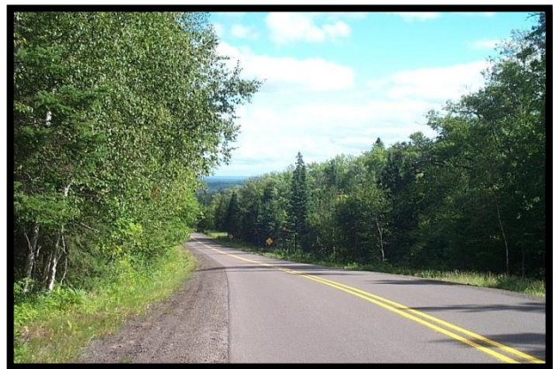
Lac La Belle Road

Lac La Belle Road (Delaware to Lac La Belle) : Exiting US 41 near Delaware, this stretch of county road drops Southeast past Helltown down towards Lac La Belle. The roadsides are forested, with only a few logging roads exiting along its length. The elevation drop allows scattered views of Lake Superior and Bete Gris when heading southeast. It is the primary