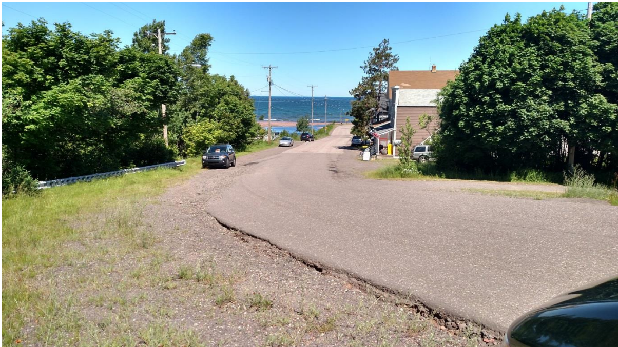
Main Street Eagle River

As projections were based on the economic trends of a locality, fertility and mortality, they are very difficult to predict. It should be anticipated that the trend to relocate to rural communities such as Keweenaw County will continue, resulting in population increases contrary to the 1996 projections.