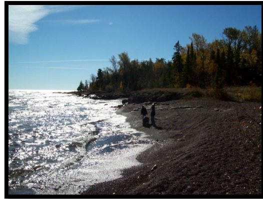
Rock picking at High Rock Bay

Section 1 documents and evaluates the existing conditions within the County and identifies issues and opportunities throughout the County. This section of the plan is followed by a Vision for Keweenaw County (Section 2) and Plan Implementation (Section 3).