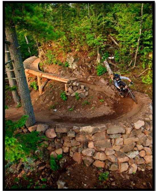
Silver Level Riding Trails near Copper Harbor

winter, biking, and hiking during non-winter months. The system, maintained by the Copper Harbor Trails Club (non-profit) is recognized by the International Mountain Bike Association as a Silver Level Ride Center, one of only seven Ride Centers in the world. A number of the nature preserves in the County also maintain hiking trails for visitors. The State, County, Township, and Private partnership is a perfect example of working together. Donations are accepted and tax deductible when made payable to the CHTC.