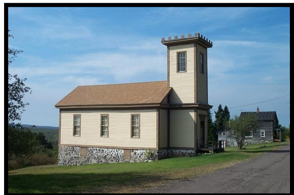
Central Mine Church

Central Mine Methodist Church - the church was once the civic center of the mining company