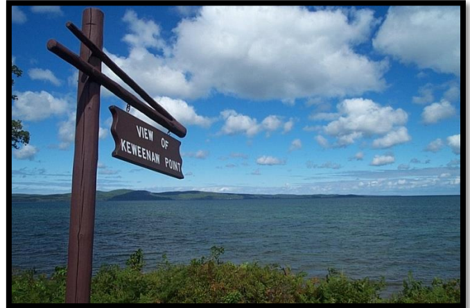
Typical Keweenaw County Road Commission Sign

Other signage is typical of Michigan roadways, including traffic signage, Scenic Michigan signs, and business signage. The zoning ordinance regulates signage within Keweenaw County, the only exception being the state trunk line routes that are governed by the Michigan Department of Transportation. Signs are regulated based on the land use in a district, and billboards are not permitted under the existing Keweenaw County Zoning Ordinance.