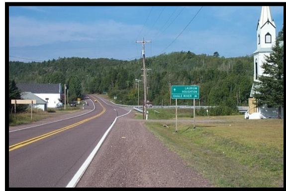
US 41 Phoenix

Each of Keweenaw County's towns has a personality all its own. From the resort town of Copper Harbor to the small lakeside community of Gay in Sherman Township, there are distinct differences in the character of each area. Following is a brief description of each of the Townships including their towns and the unique characteristics they contribute to Keweenaw County: