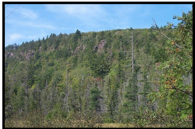
Marsh area below the Cliffs

Land and water resources are the foundation of Keweenaw County. Because natural features are interrelated and disturbance in